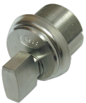
AS1179 SC Thumbturn (Boxed)